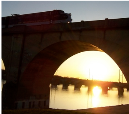
Historic Train on Historic Bridge

The above image was caught at Sunset by the Reading Railroad Bridge in Harrisburg. The train is a historic Norfolk Southern diesel engine (known as the General Motors FT) that passed this way back in April.