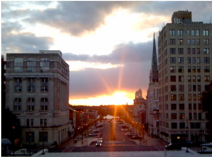
Sunset View from Capitol Steps- Harrisburg, PA (c) 2007