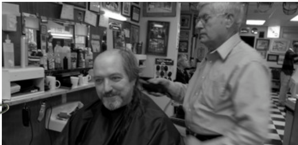
Supporting Chemotherapy Patients... and the St. Baldrick's Foundation (President of Esquire Assist tries the Chemo Look)

Poetry Man was mentioned in a National Geographic Article back in