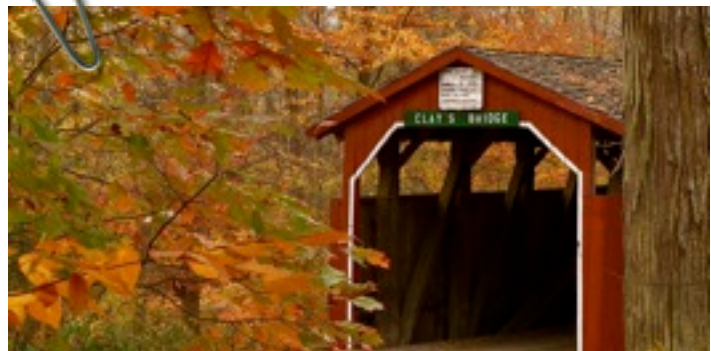
Fall at Little Buffalo - 2007

Keystone Innovation Zone Appalachian Trail Story