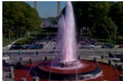
Pink Capitol Fountain - Breast Cancer Awareness 10/07